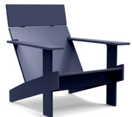
navy blue: LC-LL-NB