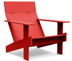
apple red: LC-LL-AR